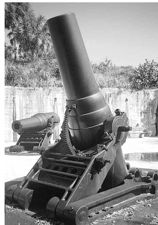
The 12-inch seacoast artillery mortars of Battery Laidley at Fort DeSoto County Park near St. Petersburg, Florida