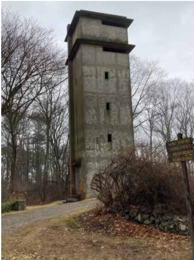
Fire control tower, Fort Foster

I visited Fort Foster in Kittery ME, March 2025, for the first time since hearing of damage from multiple storms in early 2024. The path along the shore from the Northern WW2 section of the Fort down to the Endicott batteries has been repaired with sand and gravel, all other trails are well maintained, but the pier was damaged and is going out to bid in April. All military structures