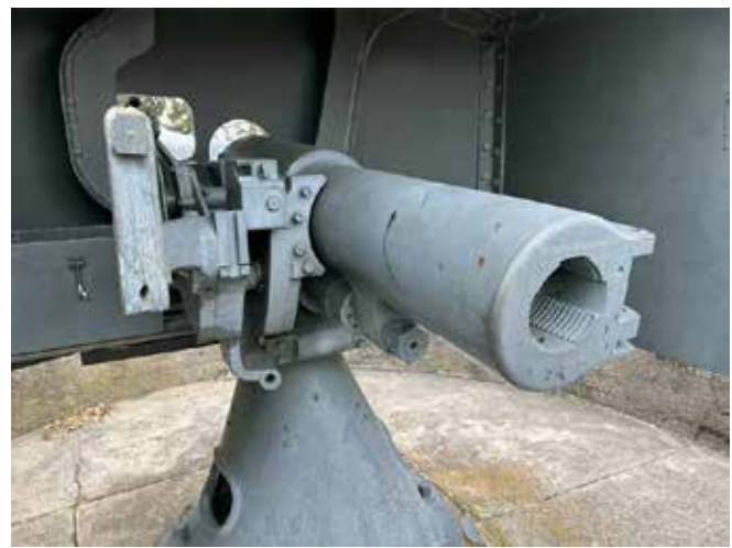
Inside the 3-inch M1903 gun's shield before treating and coating get underway