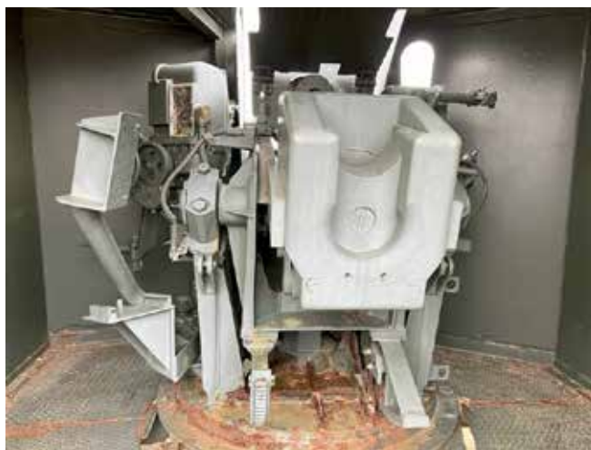
90mm M3 Fixed Mount showing vandalism and serious steel deterioration