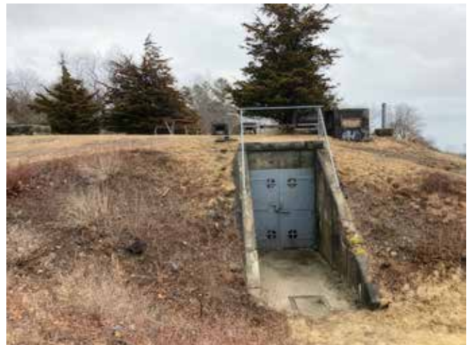
Mine casemate entrance, Fort Foster