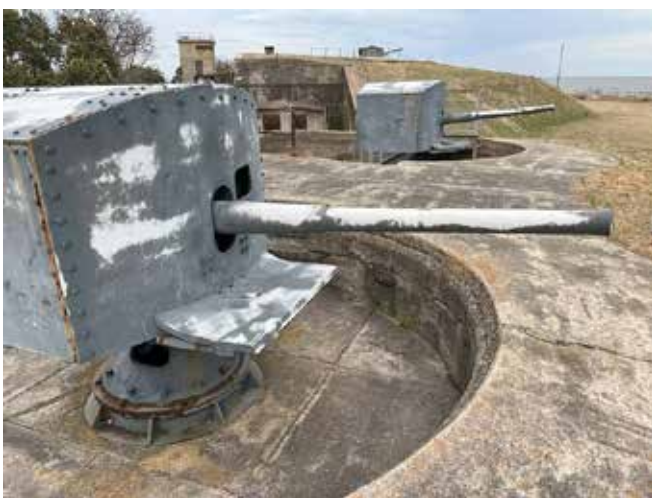
The two 3-inch M1903 guns awaiting their turn to be treated and coated