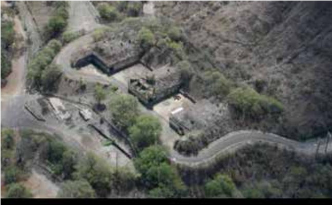
12-inch Mortar emplacement for Battery Harlow at Fort Ruger

Museum of Hawaii), and Fort Ruger (Batteries Harlow, Birkhimer, Dodge, Hulings, #407, and HDCP in the Mule Tunnel).