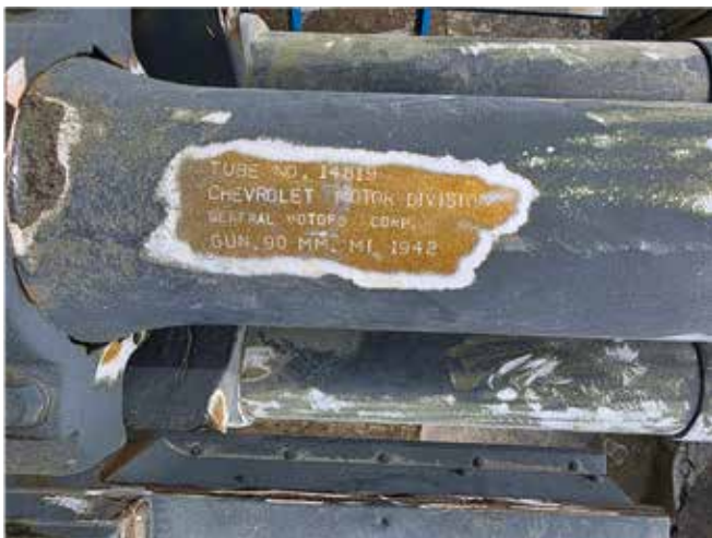
Uncovering the serial information on the 90mm barrel

If you can be a site representative or have any questions, please contact me.