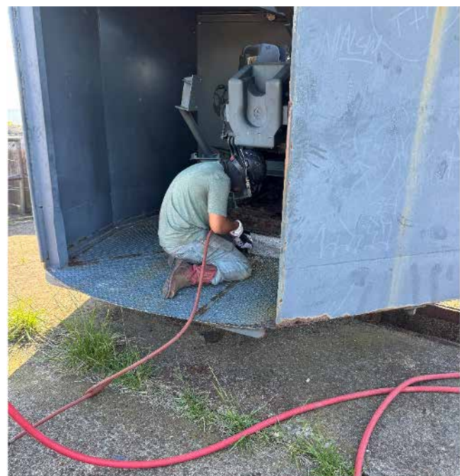
MSP employee using an air compressor to remove rust and old paint from the 90mm M3 Fixed Mount