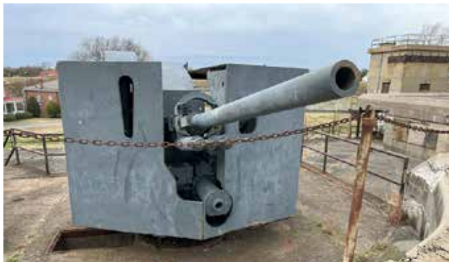
90mm M3 Fixed Mount today at Battery Parrott, Fort Monroe