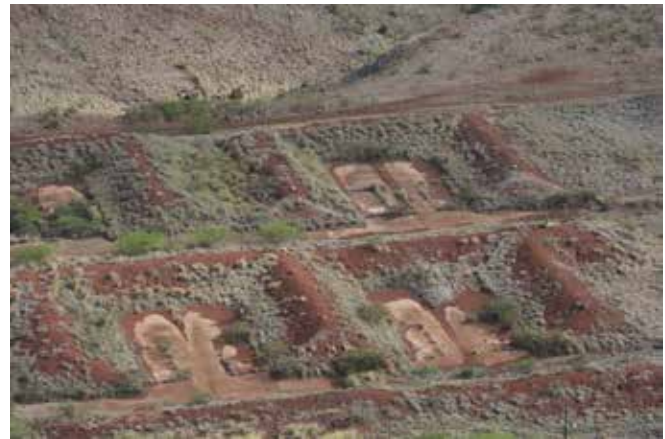
Nike Launch earthworks at Nike Site OA-63 at Kapolei, Oahu

Members could stay on extra days on their own to visit the Battleship Arizona Memorial/Visitor Center, Battleship Missouri Memorial, and Pearl Harbor Aviation Museum as well as other tourist sites.