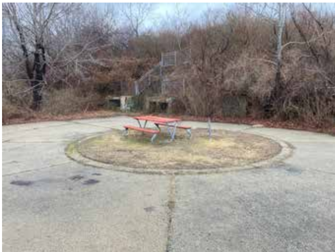
Battery 205, Fort Foster

I visited Fort Foster in Kittery ME, March 2025, for the first time since hearing of damage from multiple storms in early 2024. The path along the shore from the Northern WW2 section of the Fort down to the Endicott batteries has been repaired with sand and gravel, all other trails are well maintained, but the pier was damaged and is going out to bid in April. All military structures