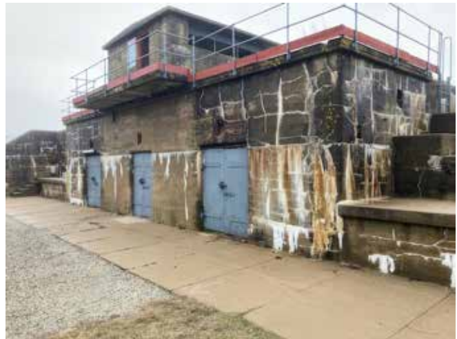
Battery Chapin, Fort Foster

have fared well. The only problem I see, (besides the filling in of the lower level of Battery Bohlen many years ago) would be the heavy growth on Battery 205, particularly the south entrance. The Fort is open Memorial Day thru Labor Day, but in the off season you can still park along the east side of the road in and walk through the gate. It can be very crowded on weekends, but there is no parking issues on the weekdays. There is a nice approximately 2-mile walking loop which contains a Fire Control Tower (locked) next to Battery 205, the partially buried Battery Bohlen (3x10"), Battery Chapin (2x3"), the AMTB 952 gun blocks (under and next to the small pavilion), the portable AMTB site (352), a searchlight shelter, along with a mine casemate and double mine observation station. Visible offshore are the wooden cribs for the Submarine/ MTB nets.