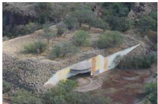
16-inch Gun Casemate for Battery Hatch at Fort Barrette

Day Three would be to the coast defenses on the southern side of Oahu. This would include the Punchbowl (Battery #304 and Station D), Fort DeRussy (Battery Randolph and US Army