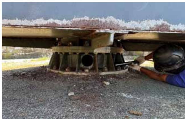
MSP employee removing rust from the base of the 90mm M3 Fixed Mount