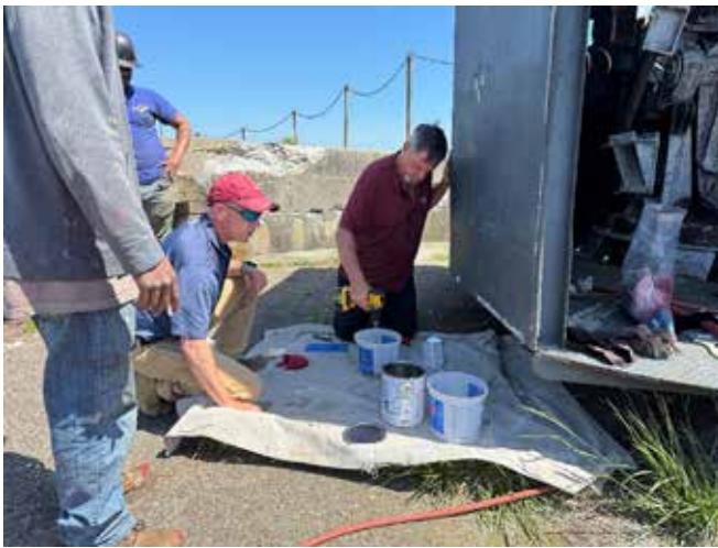
MSP employees working to fill rusted joints in the 90mm M3 Fixed Mount's shield