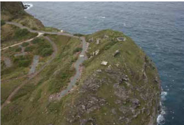
14-inch Naval Turret site for Battery Pennsylvania at Fort Hase.

Day Four would be to the coast defenses on the eastern side of Oahu. This would be Battery DeMerritt (#405), Marine Corps Base Hawaii (Battery Pennsylvania (14-inch turret), the HDCP, and Battery French (#301)), and Battery Cooper (#302). We would also have our annual business meeting and banquet that night, which would be the official end of the annual conference.