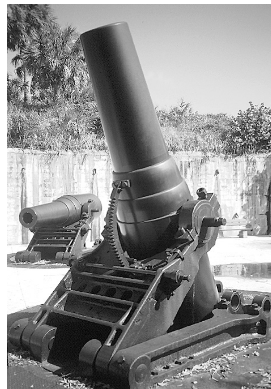
The 12-inch seacoast artillery mortars of Battery Laidley at Fort DeSoto County Park near St. Petersburg, Florida