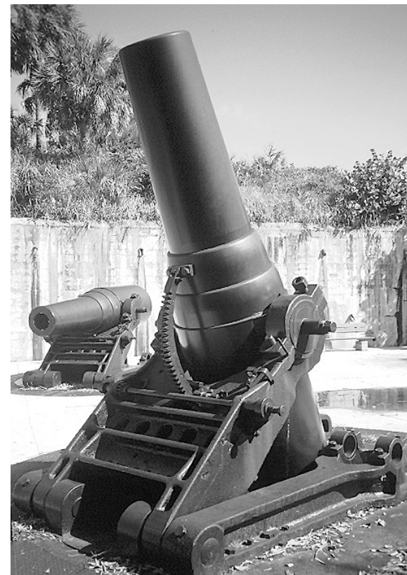
Two 12-inch Seacoast Artillery Mortars in Battery Laidley at Fort DeSoto County Park near St. Petersburg, Florida