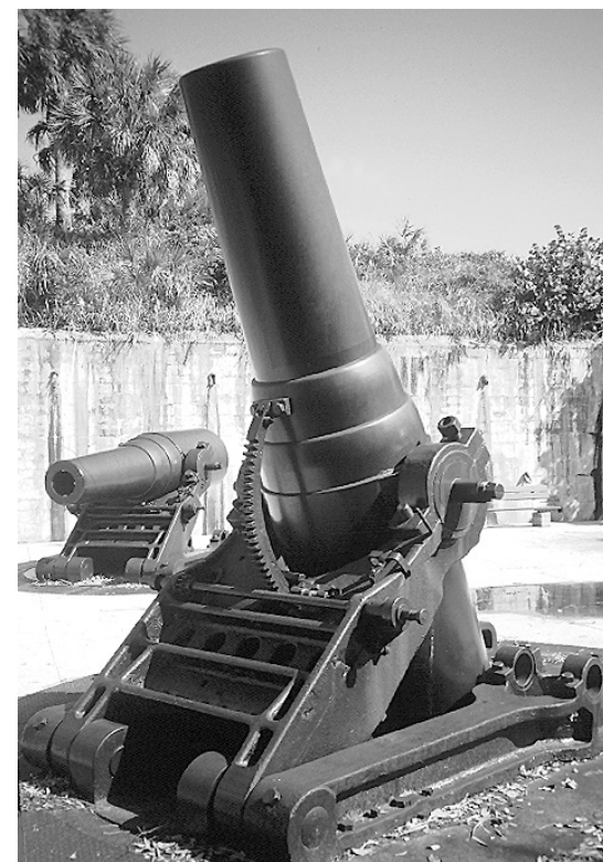
The 12-inch seacoast artillery mortars of Battery Laidley at Fort DeSoto County Park near St. Petersburg, Florida