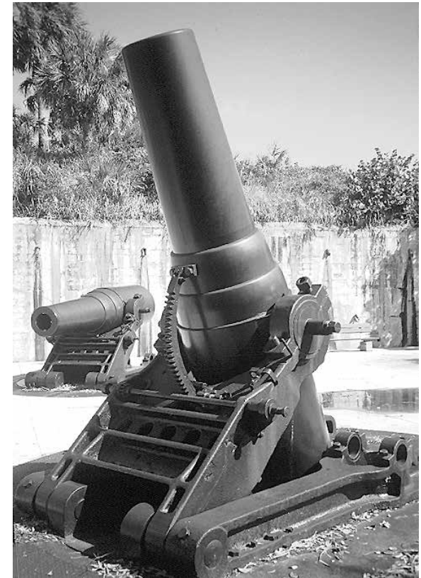
Two 12-inch Seacoast Artillery Mortars in Battery Laidley at Fort DeSoto County Park near St. Petersburg, Florida