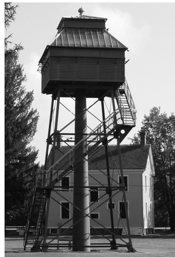
Fire Control Tower and Administration Building Fort Mott State Park, New Jersey