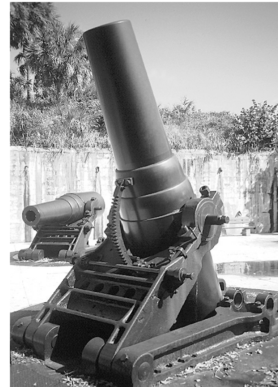
The 12-inch seacoast artillery mortars of Battery Laidley at Fort DeSoto County Park near St. Petersburg, Florida