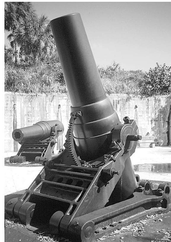
Two 12-inch Seacoast Artillery Mortars in Battery Laidley at Fort DeSoto County Park near St. Petersburg, Florida