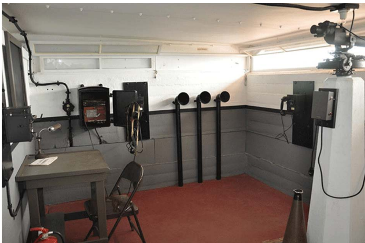
Battery Osgood's restored Battery Commander's Station