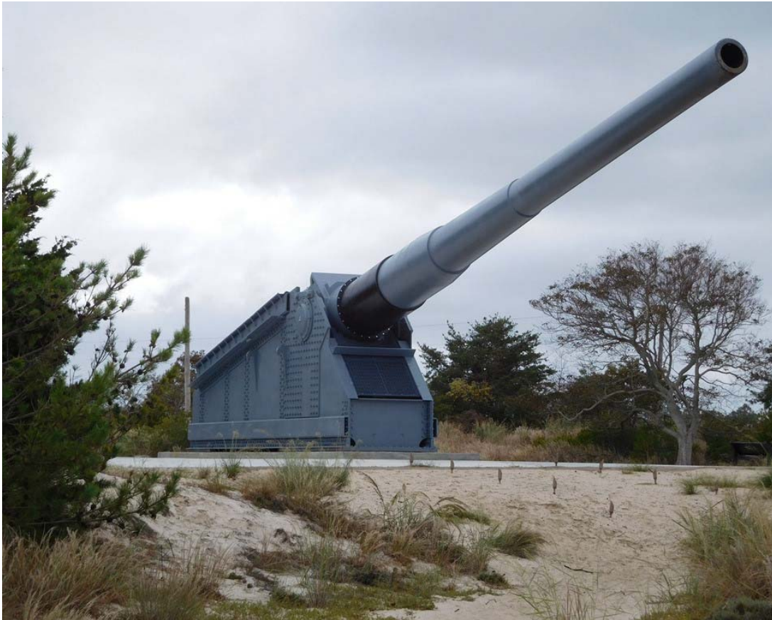
16-inch/50 gun on proof mount

Outstanding Features: Battery #519 (two – 12-inch CBC) has been turned into a fine museum. Battery rooms have been restored to original specifications and contain a shell and powder magazine, as well as plotting room display. The batteries' magazines are now museum galleries that tell the military history of Fort Miles and the coast defenses that defended Delaware Bay. The museum has a fine collection of artillery - 16-inch, 12-inch, 8-inch, 155mm, 6-inch, 90mm, 3-inch, and many more wonderful artifacts through its complex. Annually the museum holds events that brings many military related groups in the Mid-Atlantic region together on site.