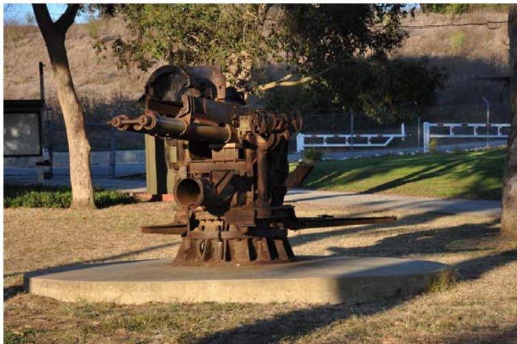
90mm T3/M3 Mount for ATMB

Contact: Open Tuesday, Thursday, Saturday, Sunday & Holidays from 12 PM to 5 PM. Arrangements for special tours can be made by contacting the museum weekdays from 10 AM to 5 PM at Fort MacArthur Military Museum - 3601 S. Gaffey Street- San Pedro, CA 90731- (310) 548-2631