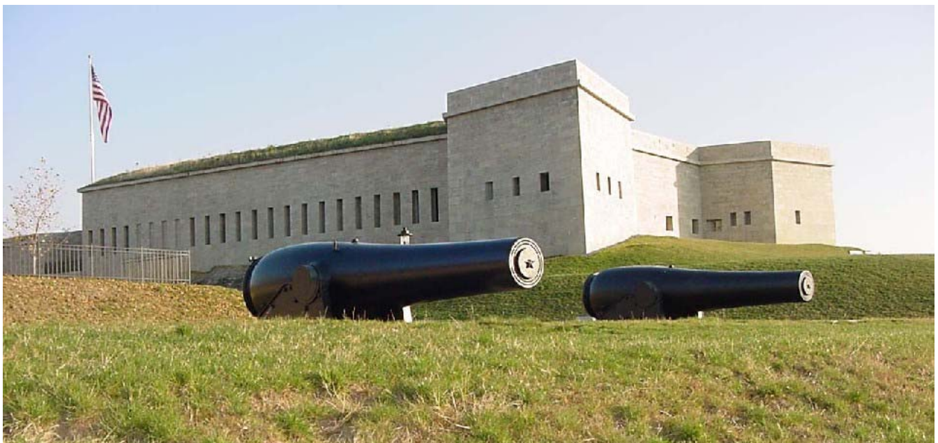
8-inch convert rifles at the South Battery, Fort Trumbull