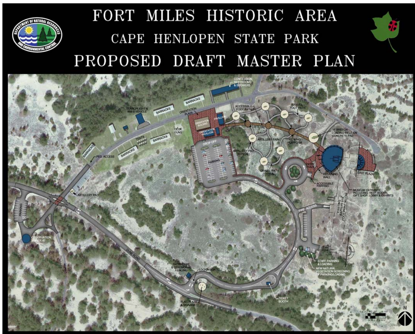
Fort Miles Historic Area (Battery #519, Fire Control tower, and cantonment area)

Lying amidst rolling sand dunes, on a high bank overlooking the Atlantic Ocean, is the Fort Miles Historical Area, home of the Fort Miles Museum. The central features of the museum include Battery 519, six barracks buildings, a fire control tower, an orientation building, and the Fort Miles Artillery Park. The museum tells the story of Fort Miles, a key piece of our nation's coastal defense, from World War II through the early 1970's. The gun batteries of Fort Miles, secret state-of-the-art installations built within the massive sand dunes of Cape Henlopen, were designed to defend against the powerful German navy. With more than 2,500 soldiers stationed on high alert, the heavy guns, mine fields and searchlights of Fort Miles defended the vital trade centers of Wilmington, Philadelphia, and beyond. As America moved into the cold war, the role of Fort Miles shifted to highly classified missions defending against the threat of Soviet submarine operations off our coastline. The Fort Miles Museum exhibits and artifacts within Battery 519 , a 15,000-square-foot fortified underground chamber, bring to life Delaware's wartime stories of submarine encounters and surrender, and hometown heroes who sacrificed for our freedom. The Museum's collection of armaments provides visitors a unique opportunity to experience first-hand how state-of-the-art technology from an earlier day was used to defend the homeland.