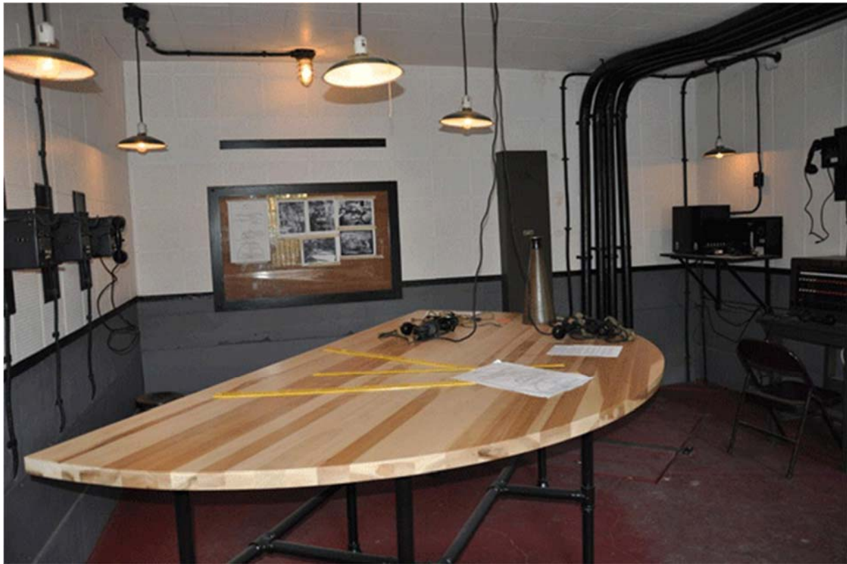
Battery Osgood's restored Plotting Room

Outstanding Features: Batteries Osgood-Farley (each one 14-inch DC) has been turned into an excellent museum. Key battery rooms have been restored to original specifications and fully equipped with coast artillery artifacts. The batteries' magazines are now museum galleries that tell the military history of San Pedro and the coast defenses that defended Los Angeles. The museum has a fine collection of searchlights, military vehicles, 155mm GPF gun, 90mm mount, AA rangefinders, 40mm AA gun, and many more wonderful artifacts through its grounds. Annually the museum holds Old Fort MacArthur Days and Great LA Air Raid events that brings many military related groups in the Los Angeles area together on site.