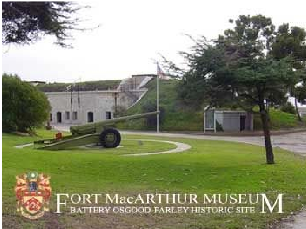
Battery Osgood-Farley with 155mm GPF on Panama Mount in foreground