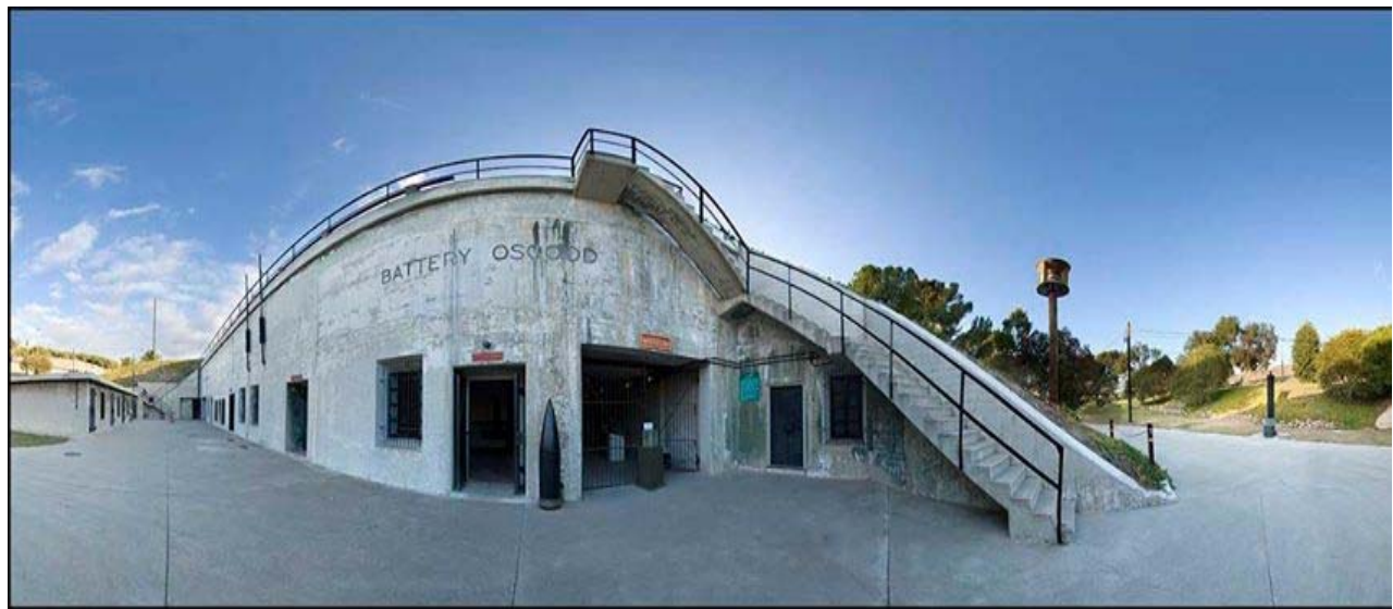
Panoramic view of Battery Osgood