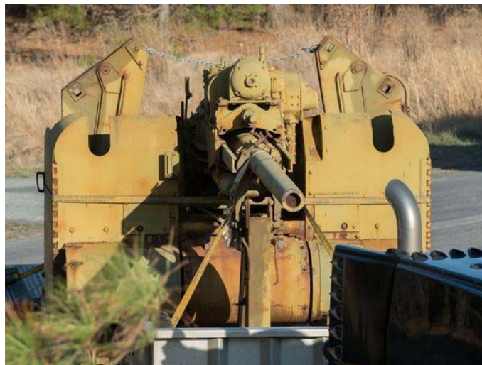
90mm M2 at Fort Miles

Contact: The grounds of the Fort Miles Museum are open 8 a.m. to sunset daily. The Museum Orientation Building is open on Fridays and Saturdays from 10 a.m. – 4 p.m. March 3 – June 10 and Tuesday through Saturday June 13 – September 9. Public access to the museum is only available through guided tours and open houses .