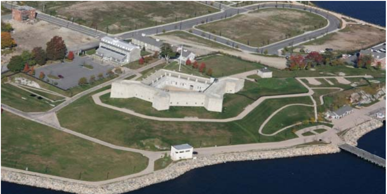
Fort Trumbull, New London, CT

Built from 1839 – 1852, the fortification is one of a group of 42 forts which were constructed for the defense of the coast of the United States, and for defense of the harbors they guarded. This group of forts became known as the Third System of Fortifications. Fort Trumbull is unique in the “Third System” because of the Egyptian Revival features incorporated in the architectural design. The Fort is a wonderful example of its era, a masterpiece in stonework and masonry. The Fort contains informative markers and displays, a touchable cannon and artillery crew display, and gun emplacements. The fort interior features 19 th Century restored living quarters, a mock laboratory, and a 1950’s era office furnished to resemble a research and development lab at the facility. The public also has access to the ramparts for a spectacular view of the New London Harbor.