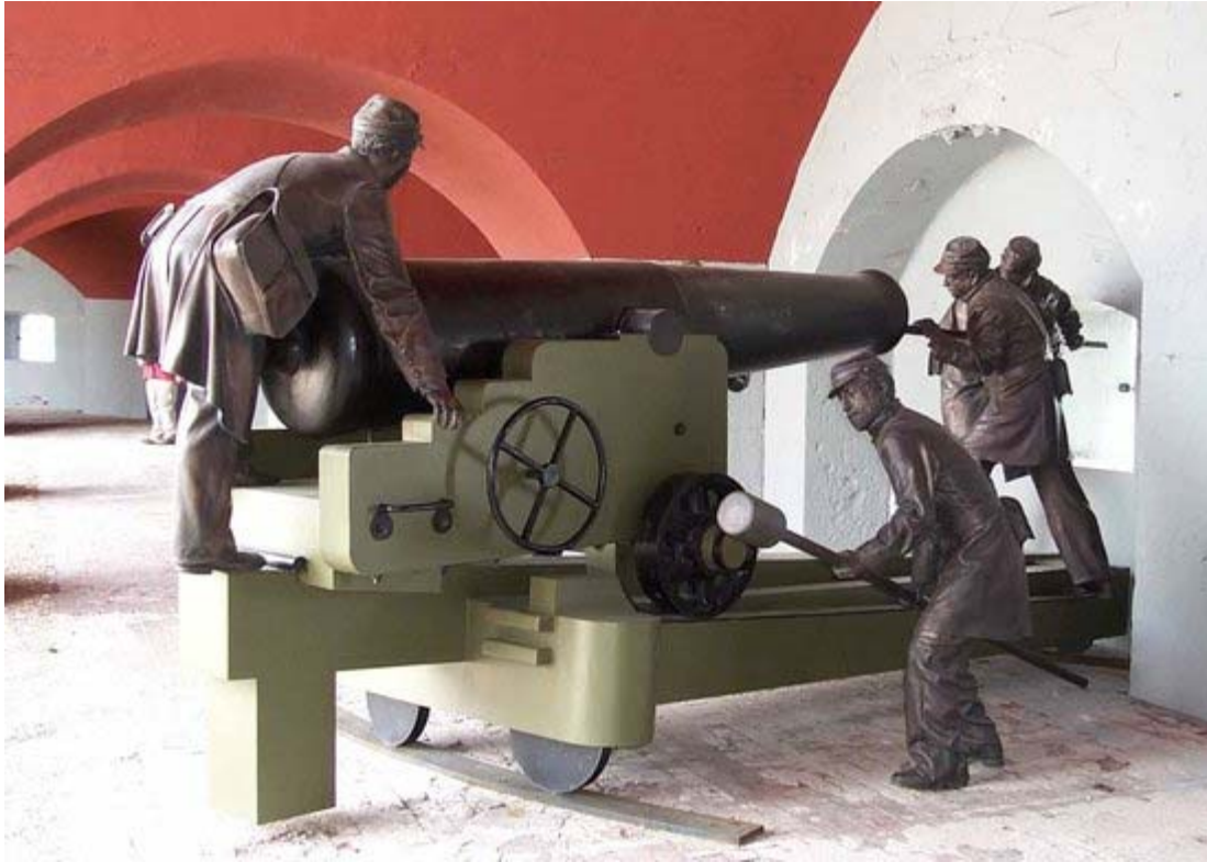
Replica cannon and carriage in Fort Trumbull's casemates