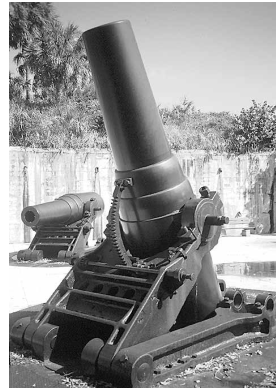
The 12-inch seacoast artillery mortars of Battery Laidley at Fort DeSoto County Park near St. Petersburg, Florida