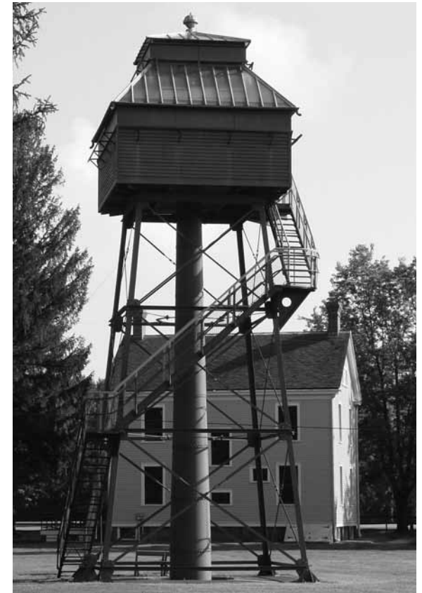
Fire Control Tower and Administration Building Fort Mott State Park, New Jersey