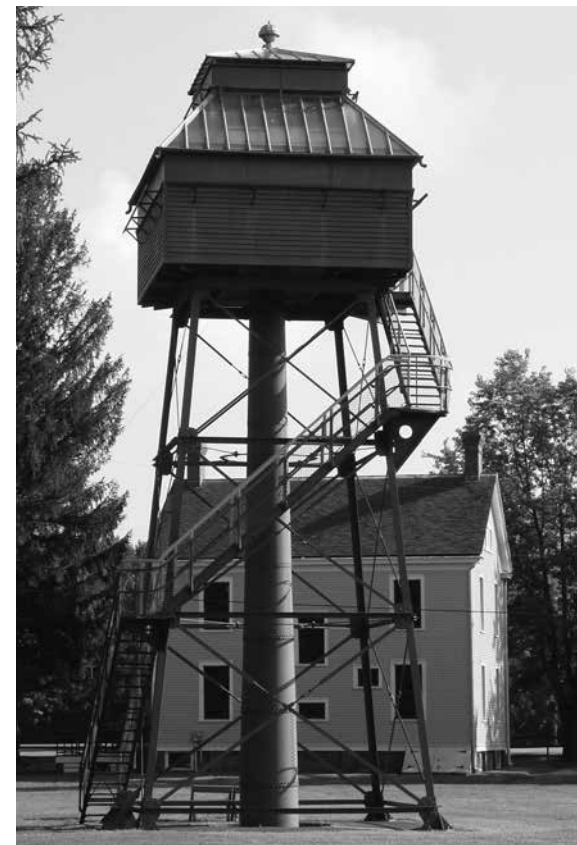
Fire Control Tower and Administration Building Fort Mott State Park, New Jersey