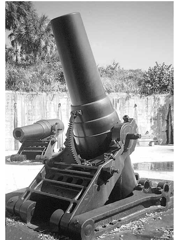
Two 12-inch Seacoast Artillery Mortars in Battery Laidley at Fort DeSoto County Park near St. Petersburg, Florida