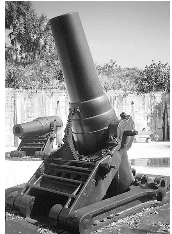
Two 12-inch Seacoast Artillery Mortars in Battery Laidley at Fort DeSoto County Park near St. Petersburg, Florida