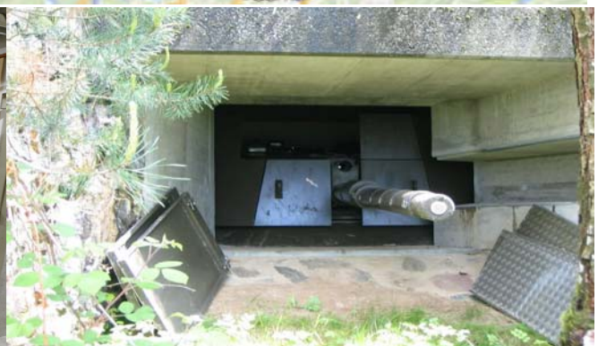
Swiss anti-tank bunker based on a Centurion tank turret