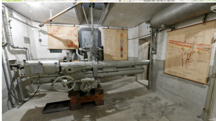
A 10.5cm gun at a former Swiss Army fort in the town of Faulensee